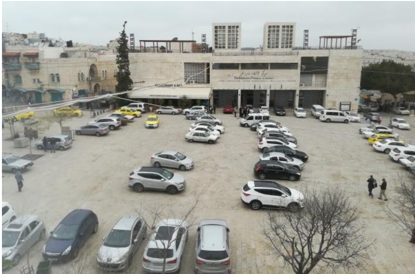
@E.Cuenca, Ville de Paris