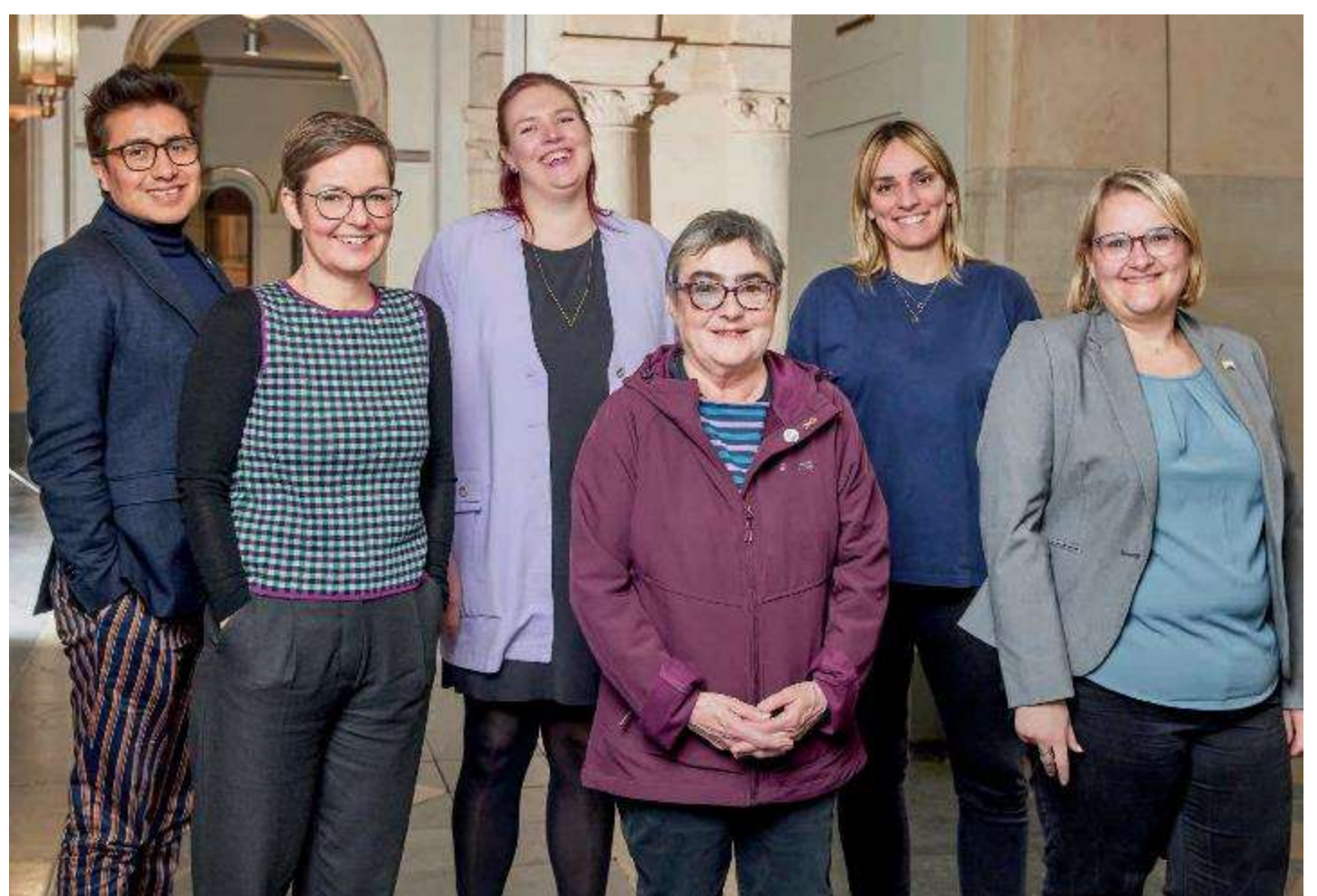
The board Rainbow Cities Network

Those numbers and findings are alarming and therefore, as a network, we wanted to put Queer Youth in the focus for our exhibition. We consider it important to recognize